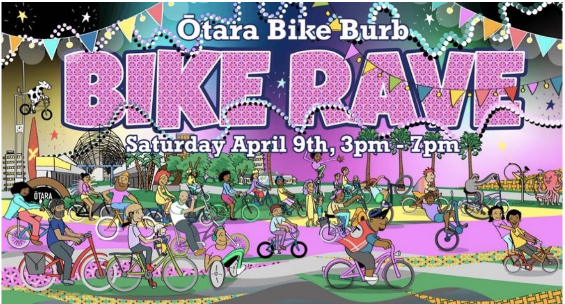
Event flyers: Top Left – Triple Teez Bike Expo; Top Right – \bar{O} tara Bike Burb Koha Fix Day; Bottom – \bar{O} tara Bike Burb Bike Rave