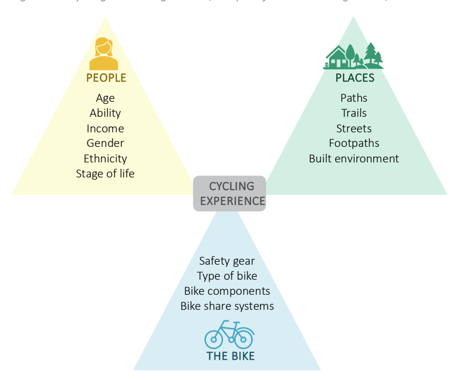
Figure 1: Bicycling assemblage model, adapted from McCullough et al., 2019

As the name suggests, Practice Theory positions practices rather than individuals or systems as the object of investigation (Rouse, 2007). Practice Theory has been widely applied to the study of routine daily activities through to highly ordered institutional processes. Within the field of transport, recent applications include an exploration of cycling cultures (Aldred and Jungnickel, 2014) walking practices (Harries and Rettie, 2016), and the use of electric scooters (Curl and Fitt, 2020).