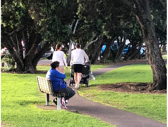
Photo credits: Left – Stuff.co.nz, Walking Samoans; Right – Author (EF)