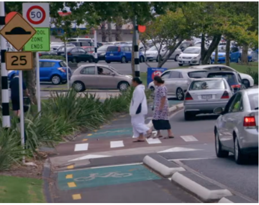
Photo credits: Left – Author (EF); Right – Te Ara Mua Future Streets